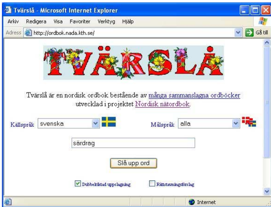
Figure 3: The Tvärslå interface. The Swedish word särdrag is looked up.