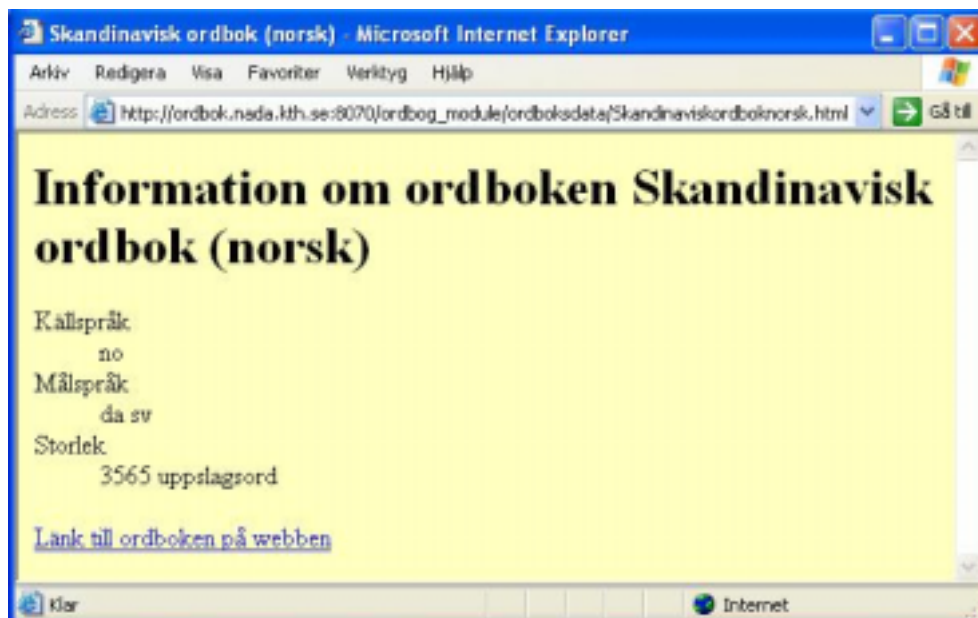
Figure 5: A dictionary information page of Tvärslå.