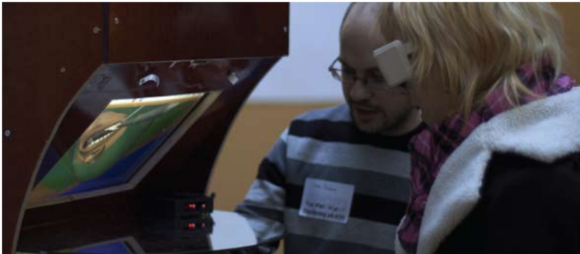
The tradition of CSC is to invite all students and their families to a family day. Pictures from Family Day 2009.