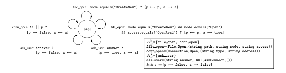
Fig. 1. Symbolic Automaton for the Example Policy

of the guards that lie above it in the clause, and the effect of the guarded command. The updates to security state variables, which are presented as a sequence of assignments in ConSpec, are captured in the automaton as functions that return one ConSpec expression per symbolic state variable, determining the value of that variable after the update. In fig. 1 we illustrate the construction on the earlier example, using "a" for accessed and "p" for permission.