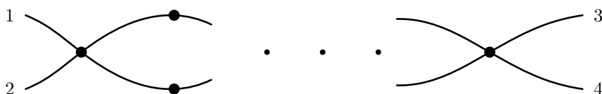
Figure 3: Recursive gadget. 4-ary signatures are [0, 0, 1, 0, 0] , and binary ones are [0, 1, 0] .

Proof. We reduce calculating the LHS of Equation (1) to \text{Holant}([0, 0, 1, 0, 0]||[0, 1, 0]) . Then since it is known that calculating the Tutte polynomial on graphs at (3, 3) is #P-hard, we conclude that \text{Holant}([0, 0, 1, 0, 0]||[0, 1, 0]) is #P-hard.