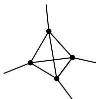
Figure 1: The tetrahedron gadget.