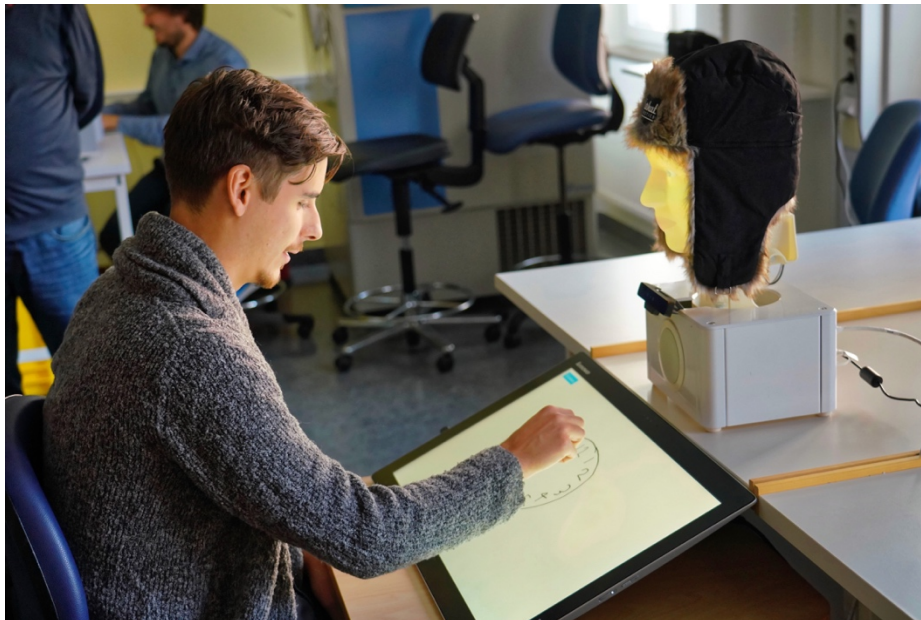
Image 2. The Furhat robot