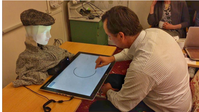
Fig. 1. Furhat and one of the authors performing a clock test (Section 4.1).

and fast animation allowing e.g. for highly accurate lip-synch. Since the face is projected on a mask, the robot's visual appearance can be easily modified e.g. to be more or less photo realistic or cartoonish, by changing the projection and/or the mask. This feature will be exploited in the participatory design study (Section 5.2).