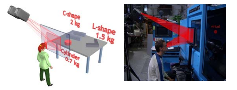
Figure 1. ASTOR uses a transparent HOE in the center of the larger window to separate the two projected views, such that each eye is presented with a different perspective, thus creating a stereoscopic effect. The red annotations and the cylinder represent virtual objects.

This type of non-intrusive augmented reality can be useful in a wide range of scenarios, such as maintenance and repair, medical visualization, and various other types of annotation, as well as the presented control of complex industrial equipment.